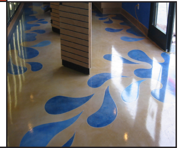
Used over a decorative concrete surface. Installed by Richard Smith Concrete